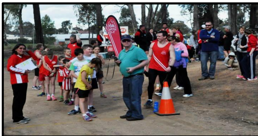
Start of 1000m under 10 race