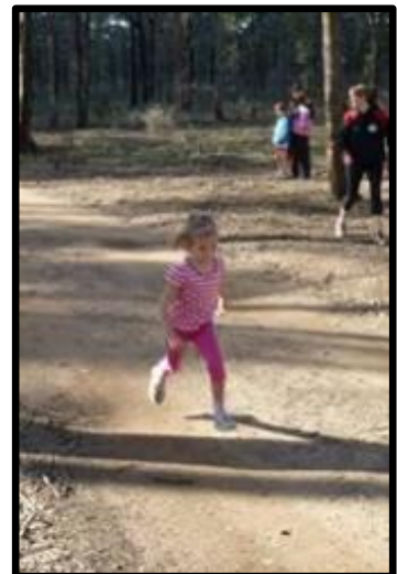
MILLERS FLAT ROAD (2)