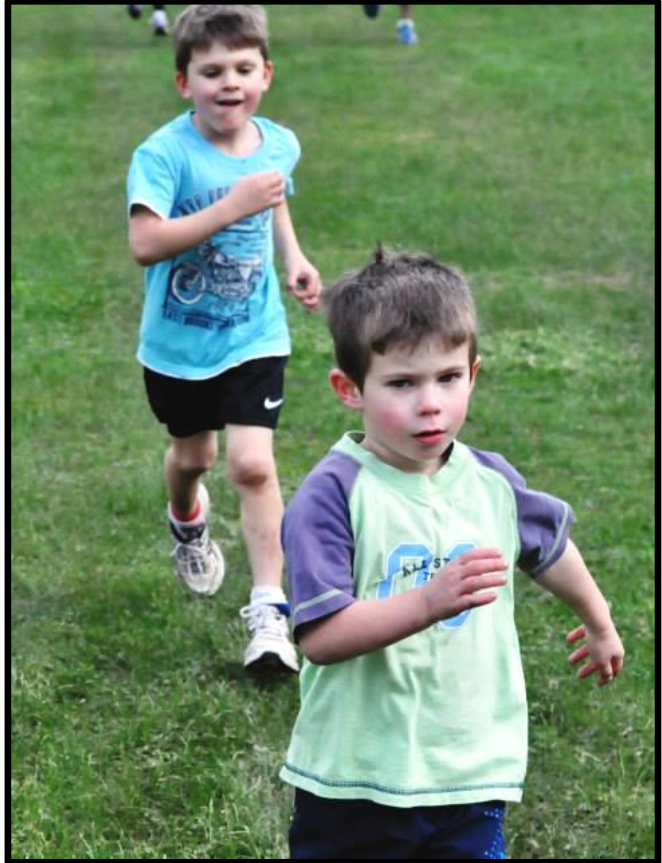
Athletics Bendigo Cross Country 8km Championships