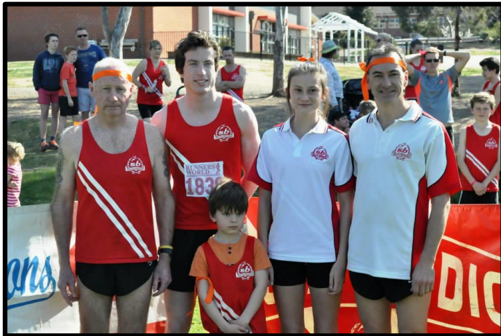
Overall time 43.28