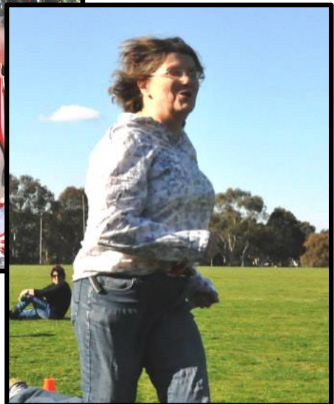
HILSON BUILDERS CUP CLUB RELAY DAY