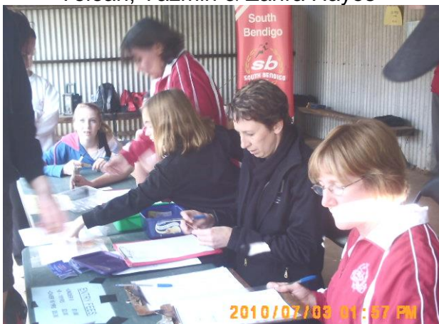
Hard working ladies taking entries